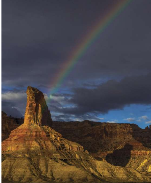
San Rafael Swell | Dean Krakel

Camp, boat and fish at this summer and winter recreation destination situated high in the Manti-La Sal Mountains. Large campgrounds include two reservable teepees. The nearby town of Scofield hosts the annual Pleasant Valley Days celebration on or around July 4.