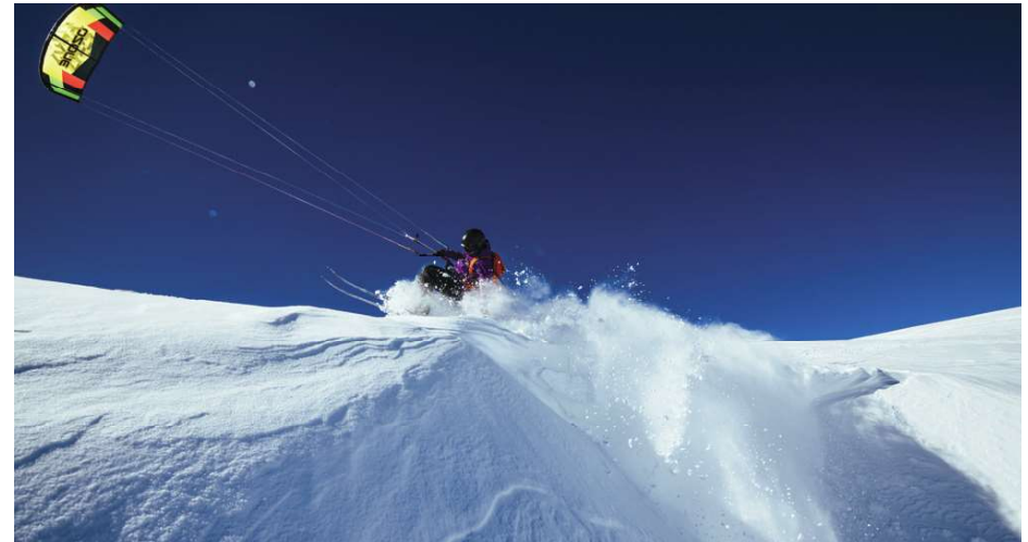
Snowkiting along Skyline Drive