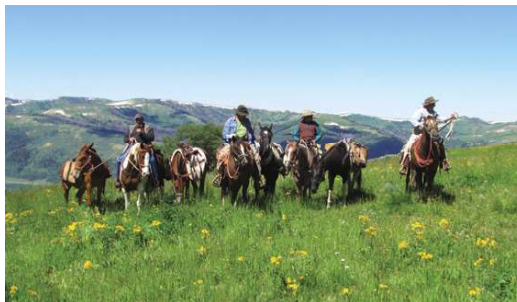
Horseback riding Candland Mountain